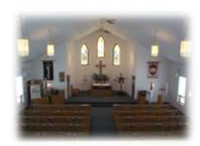
SUNDAY WORSHIP 9:45 a.m. - 10:45 a.m.