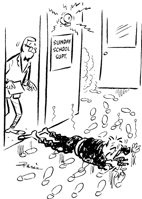
"I FORGOT HOW FAST THE MEN RUSH OUT FOR A SMOKE."

family and loved ones over their loss. We also rejoice with them in the blessed assurance of the Resurrection in Jesus Christ. "For if we live, we live to the Lord, and if we die, we die to the Lord. So then, whether we live or whether we die, we are the Lord's. (Romans 14:8)