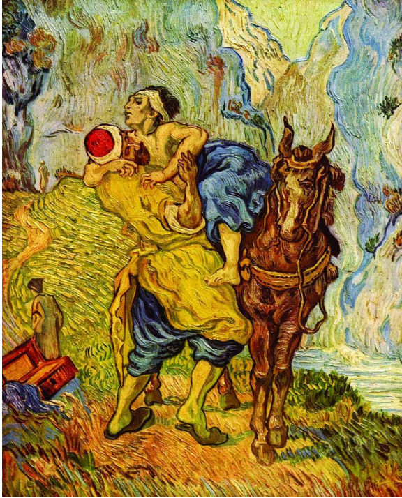
The Fifth Sunday after Pentecost July 10, A+D 2022