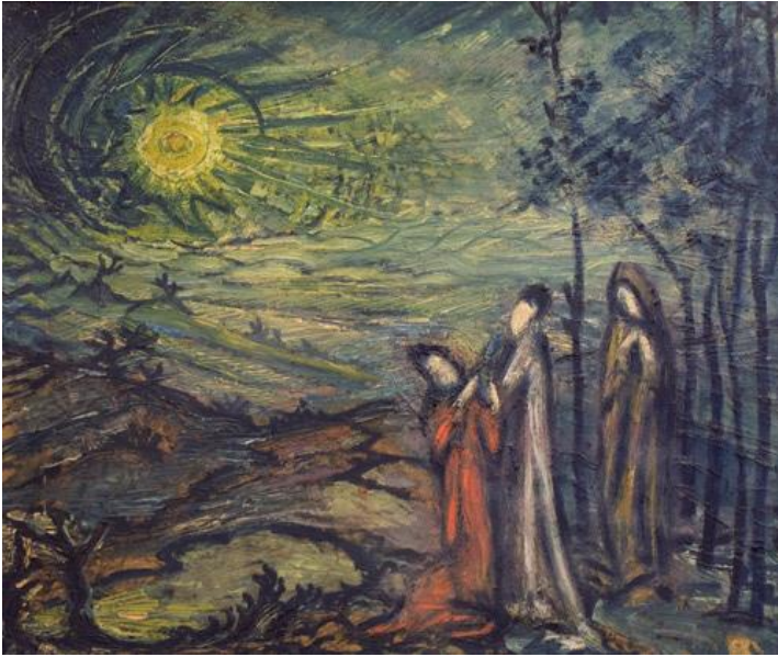
Star of Bethlehem by Waldemar Flaig

The Epiphany of Our Lord The Baptism of Our Lord King of the Jews...and Gentiles, Too January 8, A+D 2023