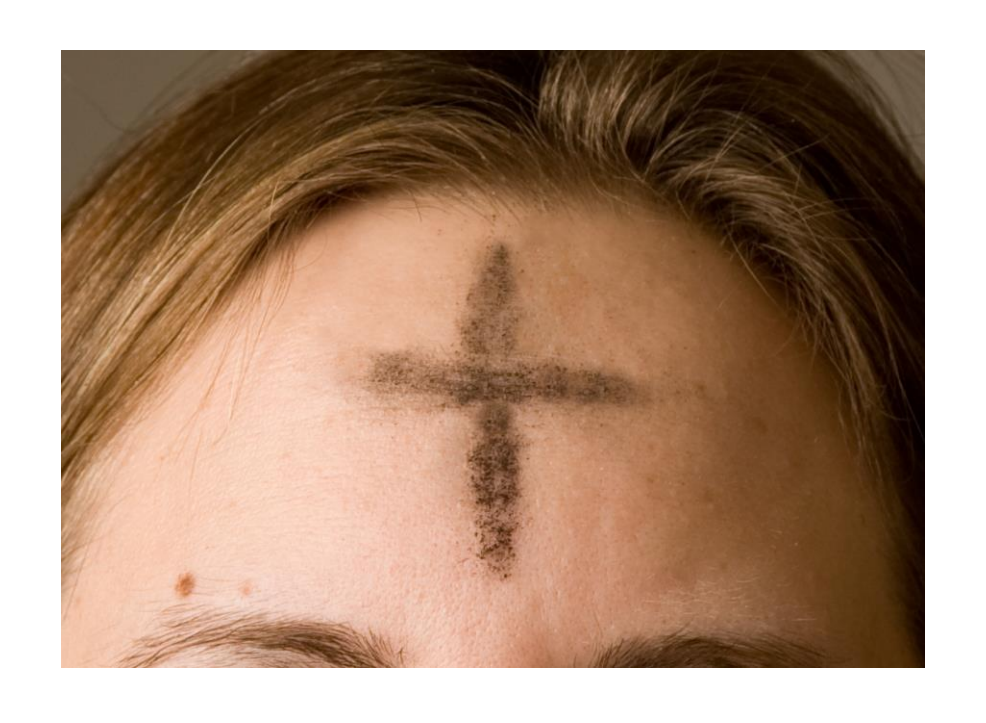
Guided to the Cross Ash Wednesday Guided to Forgiveness February 14, A+D 2024