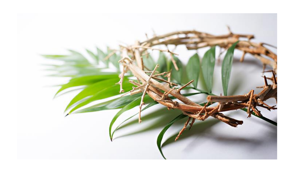
Sunday of the Passion\Palm Sunday March 24, A+D 2024