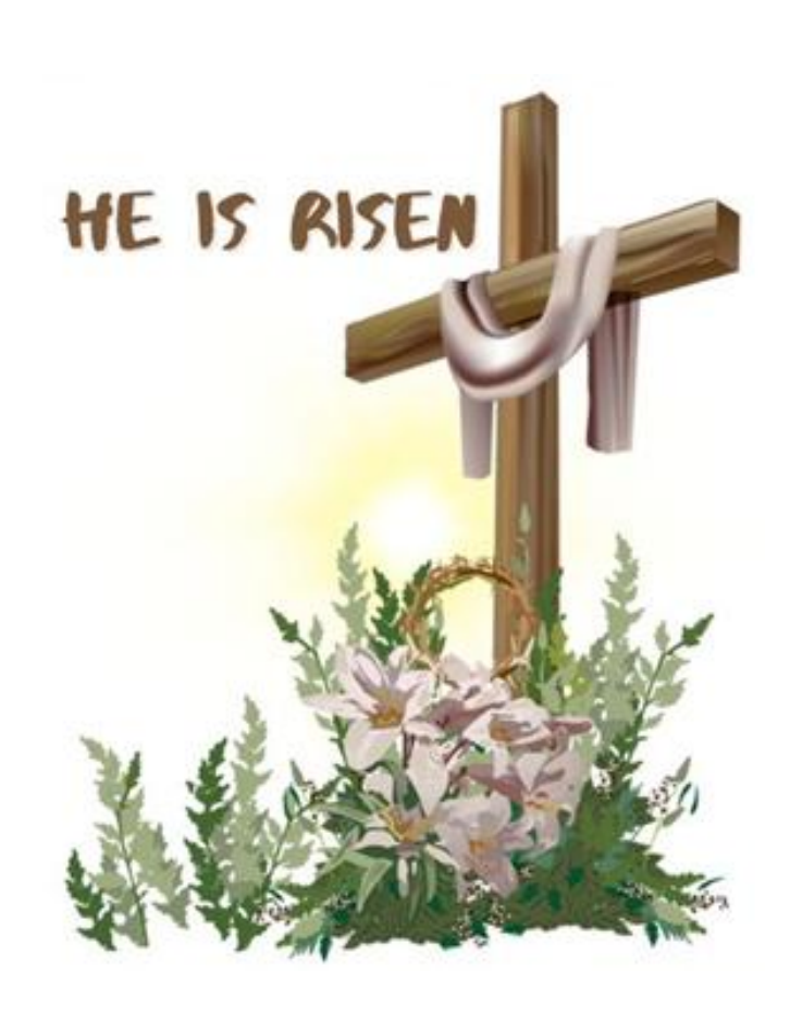
The Resurrection of Our Lord April 20, A+D 2025